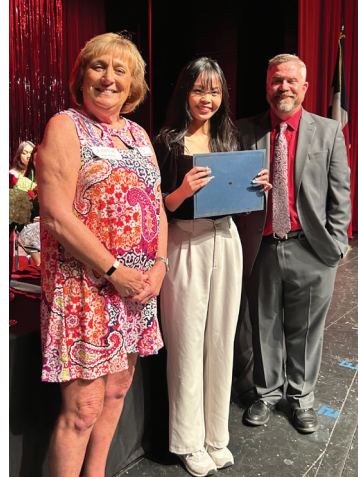
Scholarship winner from North Garland