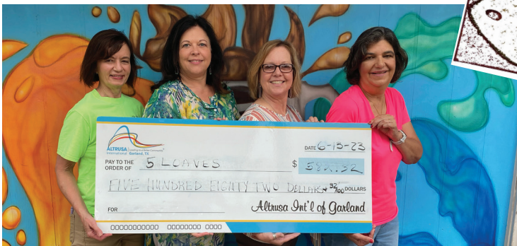
Presentation of the "big check" to the 5 Loaves Pantry