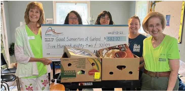
Presentation of the "big check" to the Good Samaritans of Garland